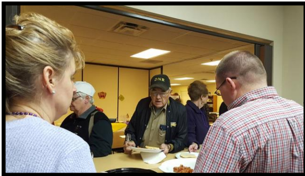
Serving Fat Tuesday pancakes. One of the fund raisers for Montreat.