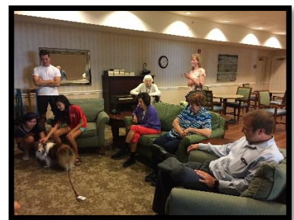
Indee visits The Hearth