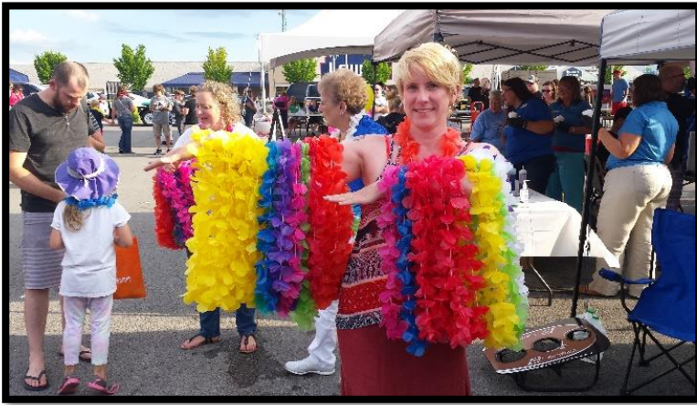
Promoting our Moana weekend at National Night Out