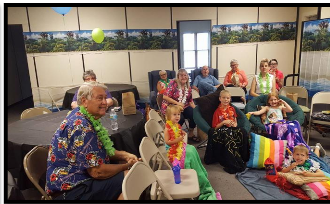
Moana Movie Night