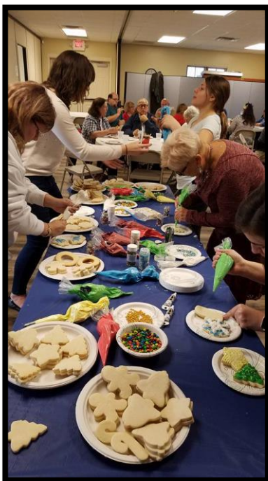
Christmas cookie decorating