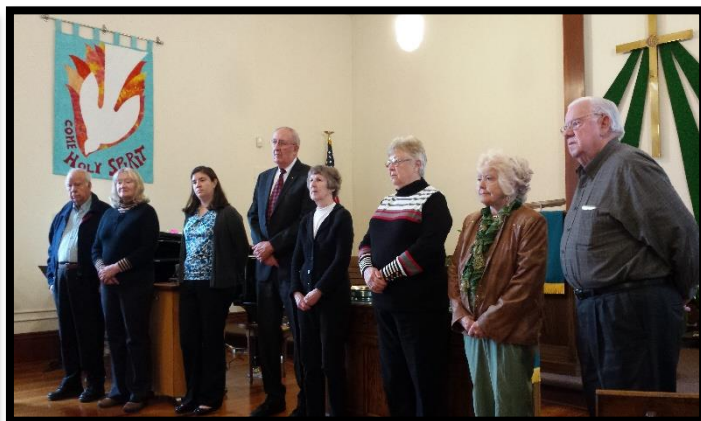
Fall Membership Class