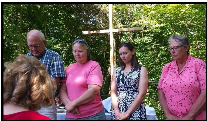
Spring Membership Class