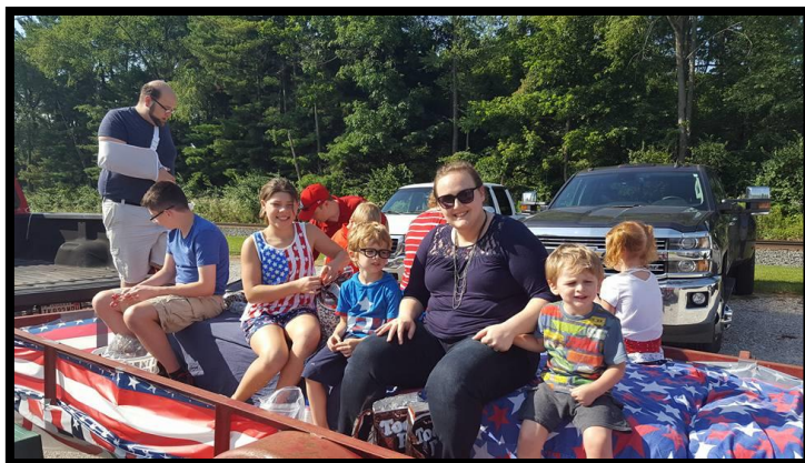
Brownsburg 4 th of July Parade